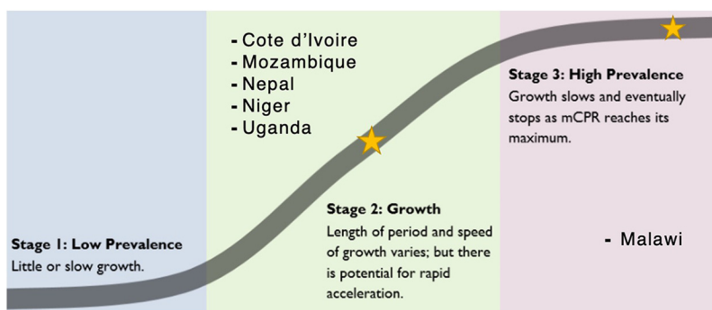
FIGURE 1. Location of Countries Preparing a Family Planning Research and Learning Agenda on the FP S-Curve a

Abbreviations: FP, family planning; mCPR, modern contraceptive prevalence rate.